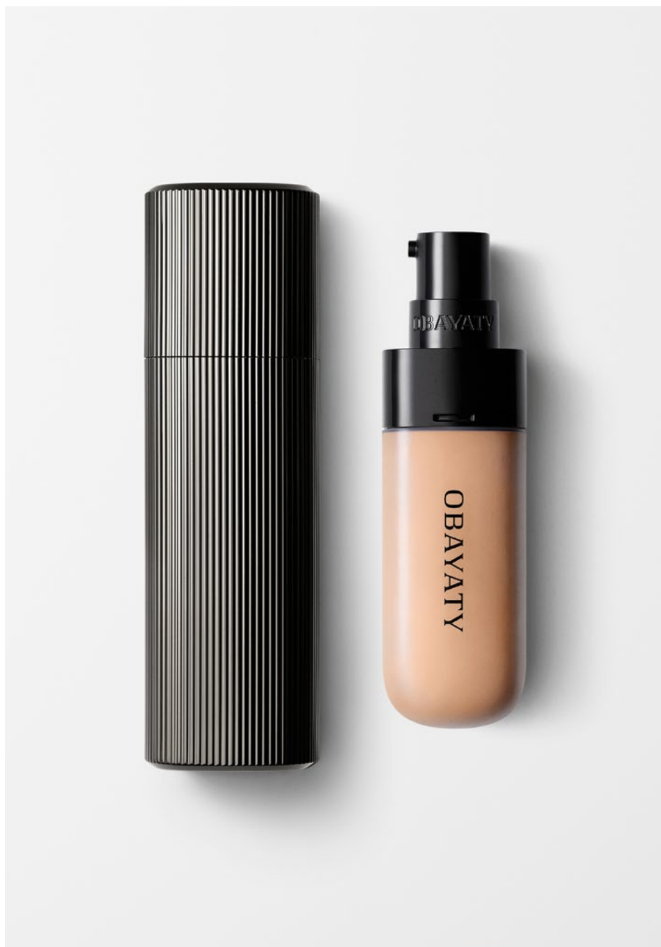
Skin Perfector refill with case.