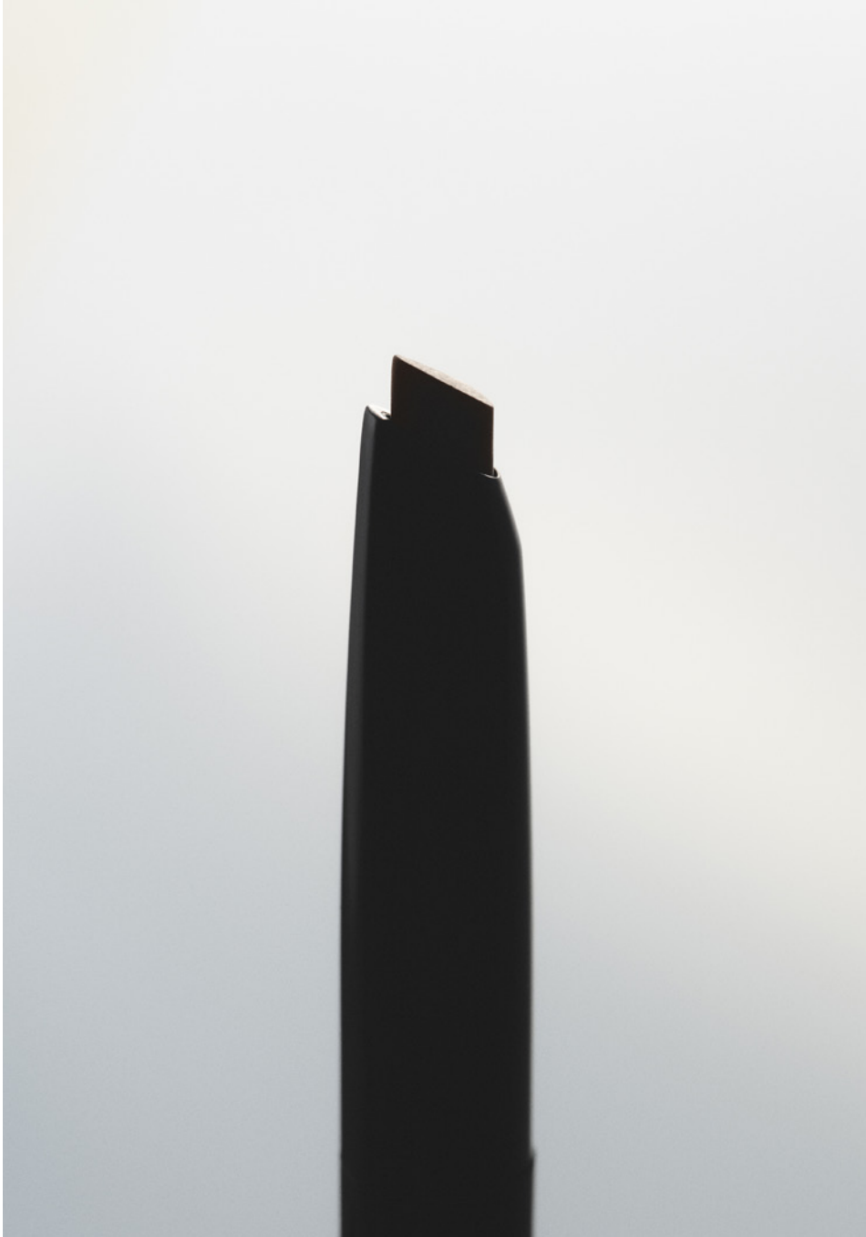
Triangular tip of Beard Brow Pen; Brown.

For further images and information visit obayaty.com/press .