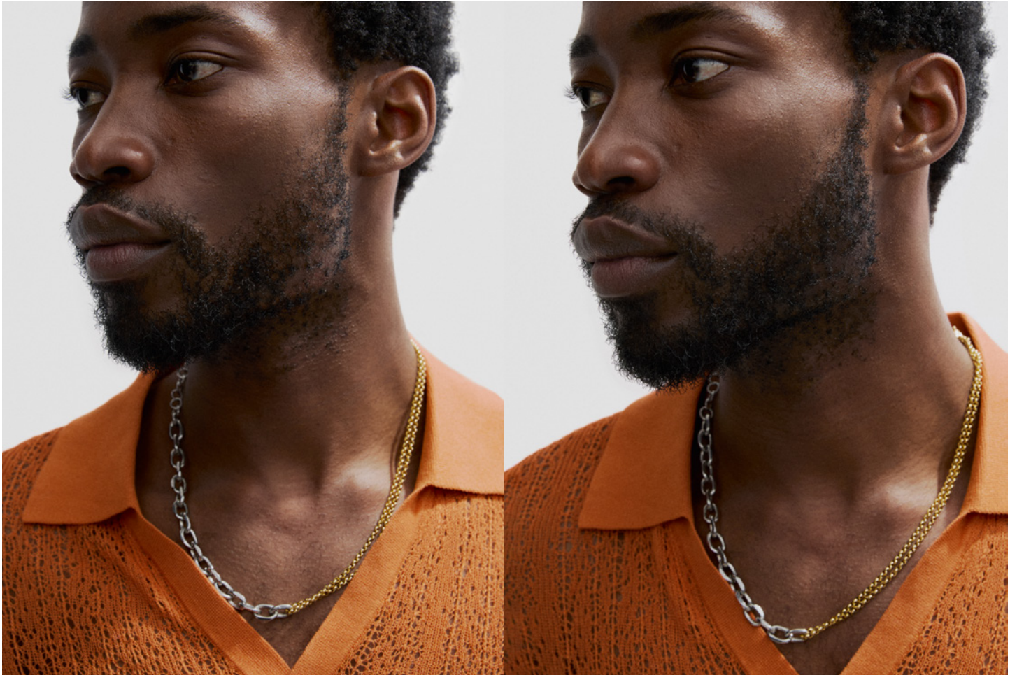
Before, left, and after, right.