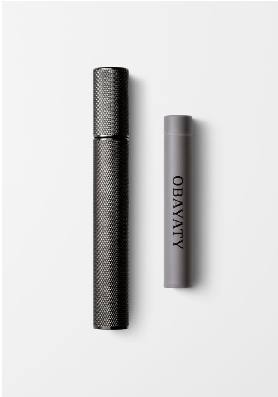
Eye Booster refill with case.