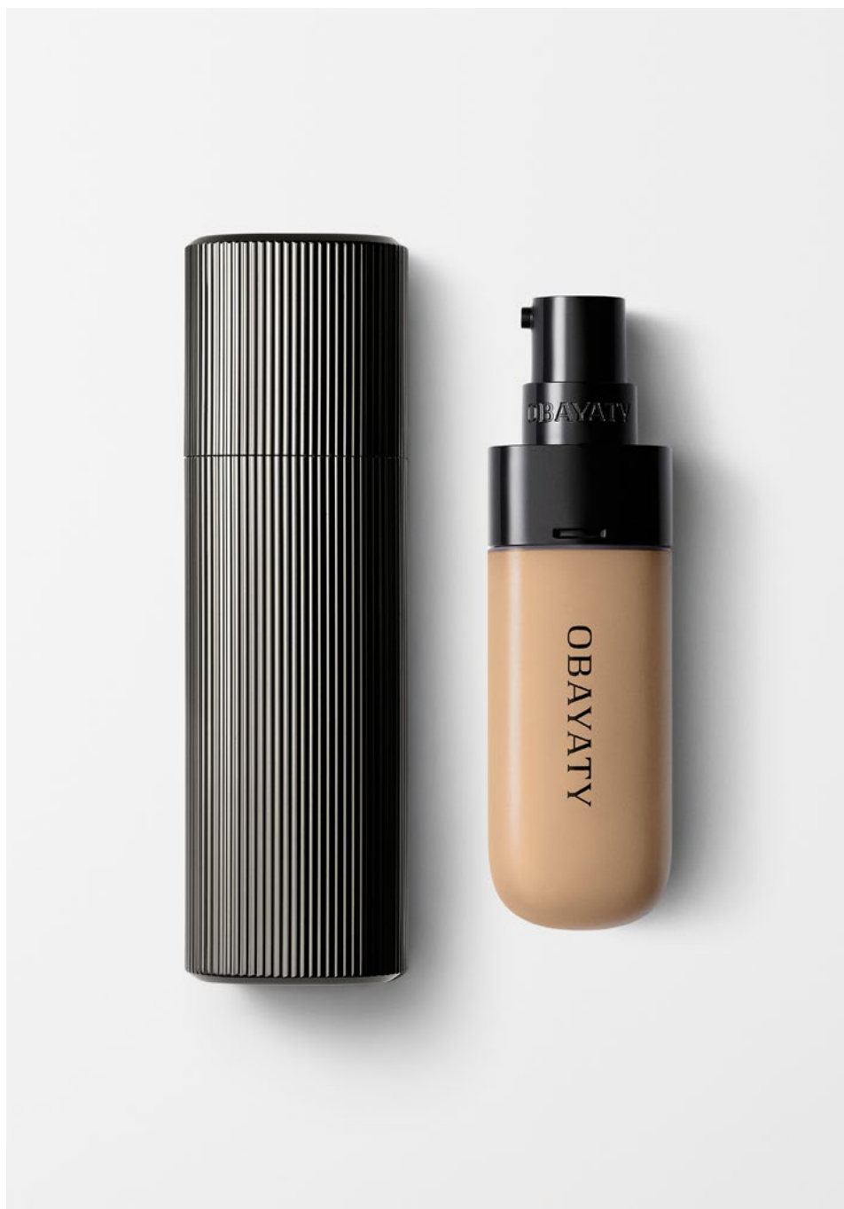
Face Booster refill with case.