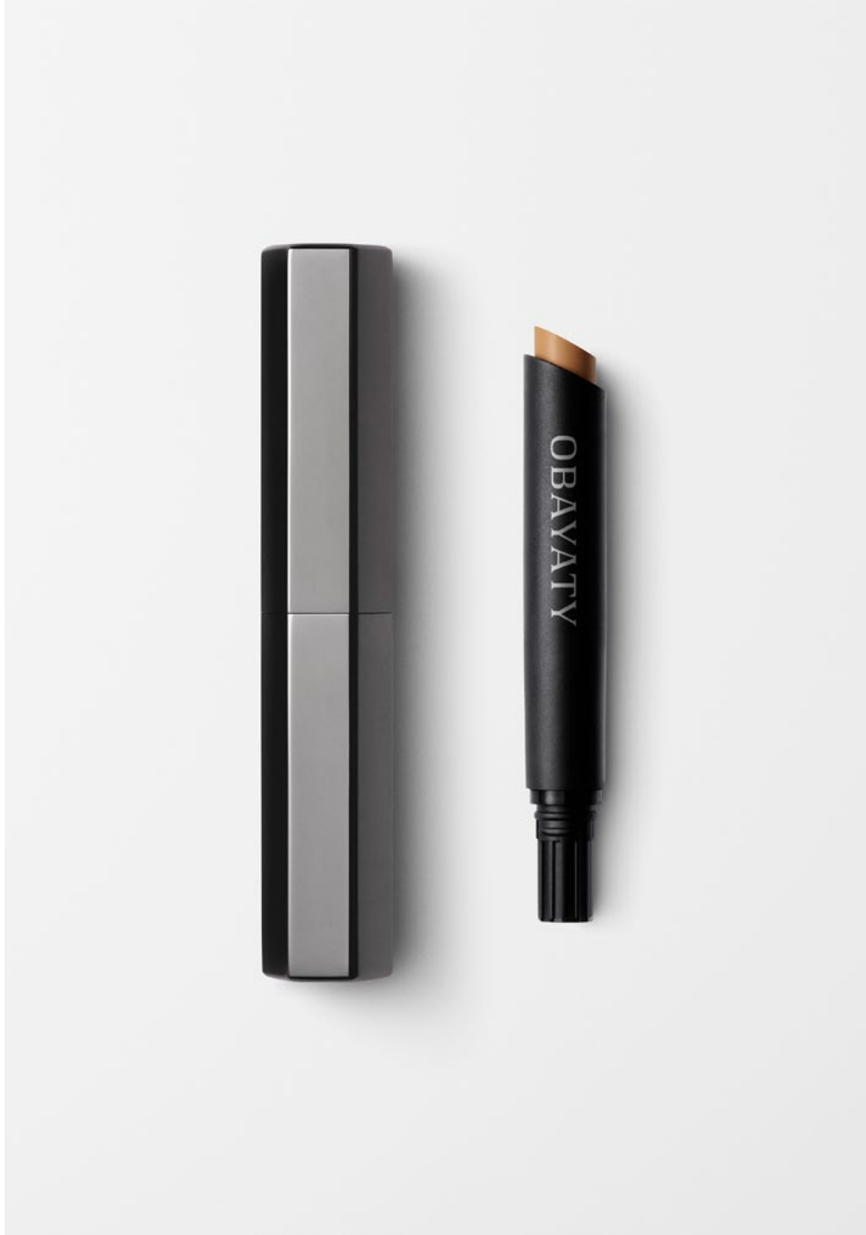
Retouch Stick refill with case.